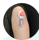
Fig. 2 DBS Collection