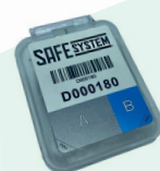
Fig. 3 Innovero Safe System