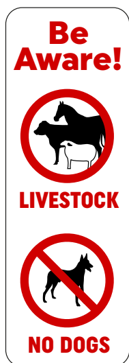
Figure 1: General livestock warning signage

Many developed trails go through active farmland containing livestock. This is generally not an issue. However, not all walkers may be familiar with livestock. If a trail is going through land where livestock is present, information about the trail (online and on the information board) should include instructions as to how walkers should conduct themselves when on land with livestock present. (An example of the instructions is provided in Appendix A and an infographic which can be used is provided in Appendix B ).