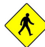
W 140: Pedestrians

6.17.4 The sign may also be provided where vulnerable road users are likely to cross a road in appreciable numbers.