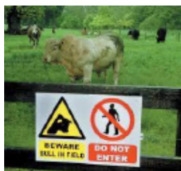
Figure 2: Bull warning sign

A critical factor in avoiding incidents with livestock on trails is to avoid bringing dogs. Where a trail crosses land with livestock present, this must be made clear in information about the trail and on signage at the start of the trail or any other access points. An example of a suitable sign is provided below in Fig. 1 .