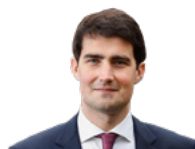
Minister of State for Sport and the Gaeltacht Jack Chambers TD