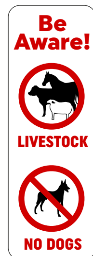
Figure 1: General livestock warning signage