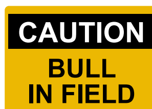
Figure 2: Bull warning sign

It is best practice to include signage on the trail that indicates when users are entering land where livestock is present. An example of a suitable sign is provided in Figure 1.