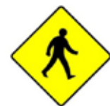
W 140: Pedestrians

6.17.4 The sign may also be provided where vulnerable road users are likely to cross a road in appreciable numbers.