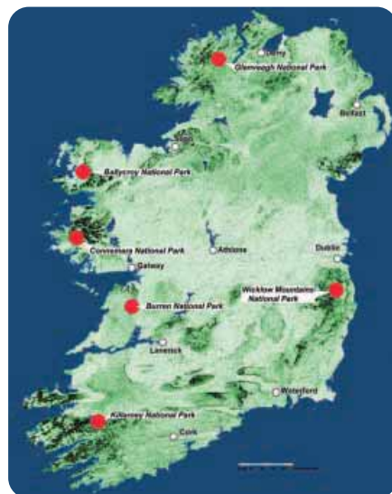
Irish National Parks

Connemara National Park is situated in north-west Galway and is 2,070 hectares in area. The Park is on the edge of the Twelve Bens mountain range and encompasses blanket bog, heaths, grasslands and exposed rock. There is a waymarked trail on Diamond Hill near the Visitor Centre at Letterfrack. Further details are available at www.connemaranationalpark.ie